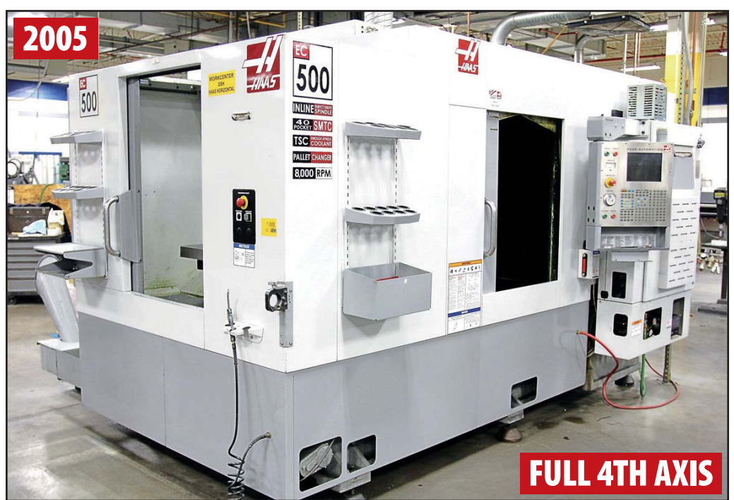
HAAS EC-500-4AX CNC HORIZONTAL MACHINING CENTER

Sale Closing From: Thursday, June 8, 2017 at 11:00 AM EDT