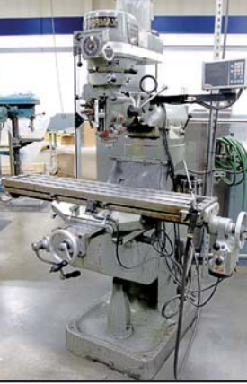
SUPERMAX VERTICAL MILL

KRAMER INDUSTRIES BLAST CABINET, 26" Rotary Table, w/Dust Collection System