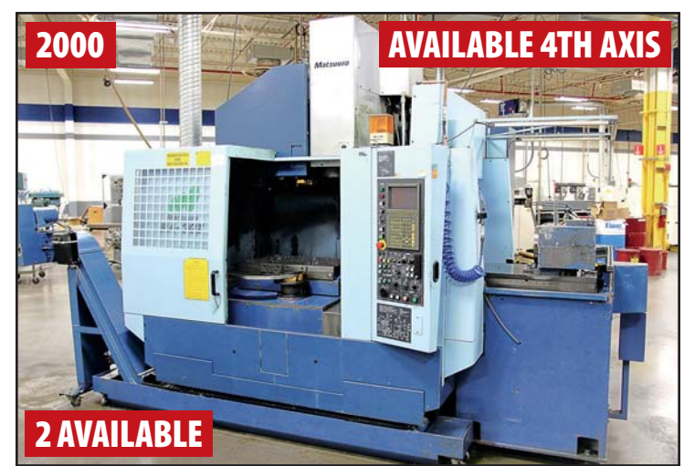
MATSUURA RA3G-II CNC VERTICAL MACHINING CENTER

(3) TSUDAKOMA AND (1) HAAS 4TH AXIS ROTARY TABLES (OVER 350) CAT 40 AND BT 30 TOOL HOLDERS