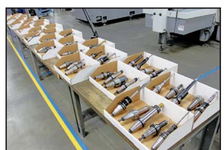
(OVER 350) CAT 40 AND BT 30 TOOL HOLDERS