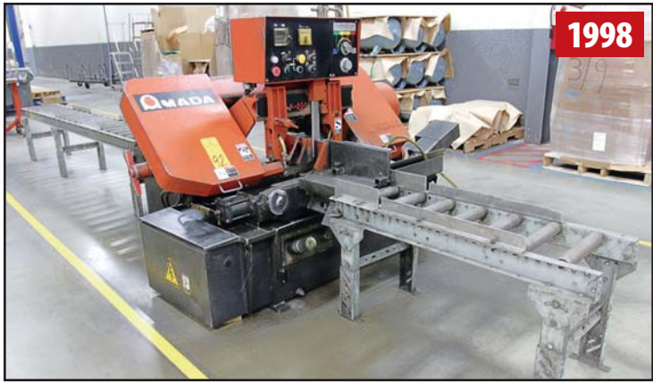
AMADA HA250W HORIZONTAL BANDSAW