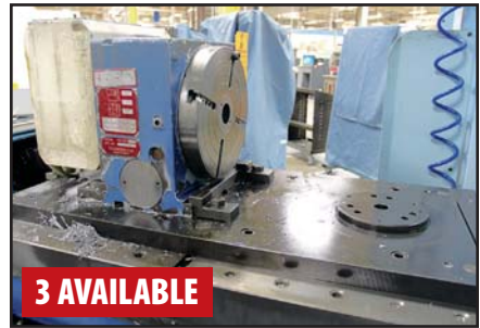
TSUDAKOMA 4TH AXIS ROTARY TABLE