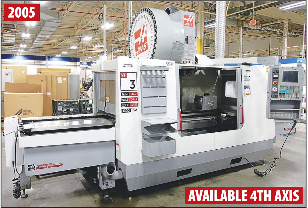
HAAS VF3D-APC-Q CNC VERTICAL MACHINING CENTER

View our current auction schedule at www.perfectionindustrial.com