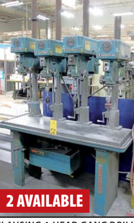
CLAUSING 4-HEAD GANG DRILL